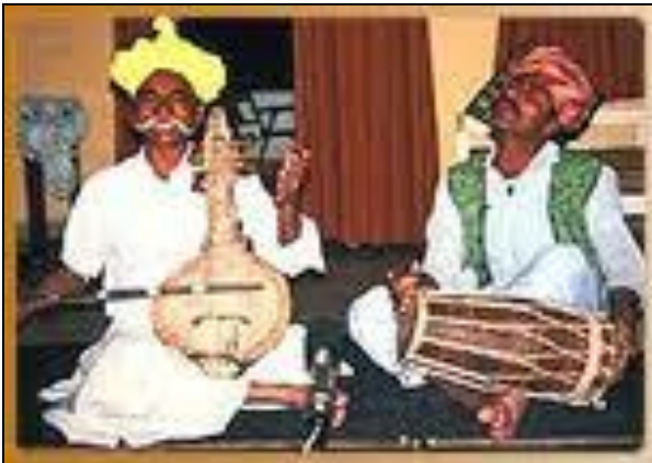
A recital of the oral epic of Pabuji in progress