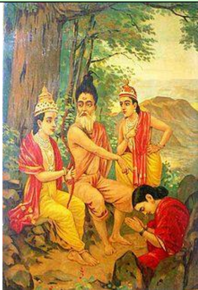
(Rama liberating Ahalya)