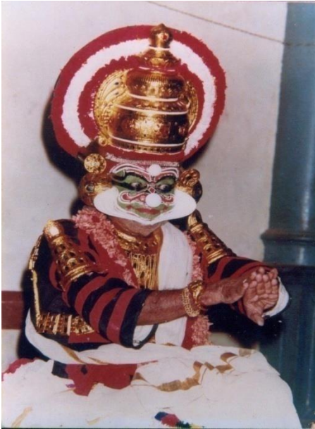
Figure 3: The 2,000 year old Sanskrit drama tradition Kutiyattam, performed in Kerala, southern India, strictly follows the Nāṭya Shāstra . Guru Nāṭyāchārya Māni Mādhava Chākyaṛ as Ravana in Bhasa's play Abhiṣeka Nataka