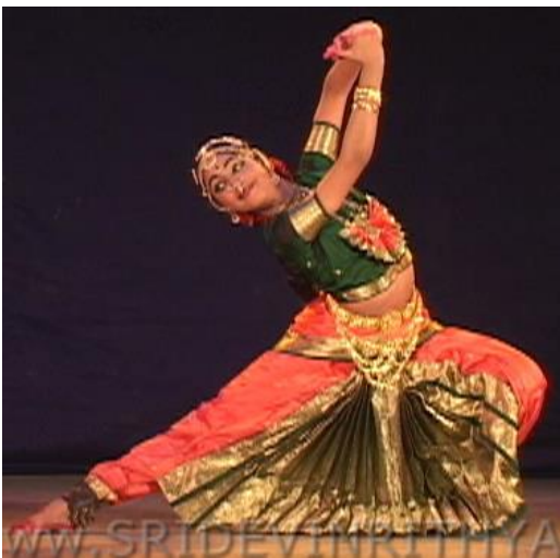
Figure 4 : Mudras in Bharatnatyam