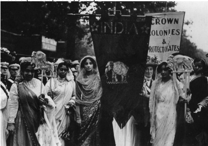
Figure 3: Tagore was hailed for supporting women's movements through plays like Chitrangada