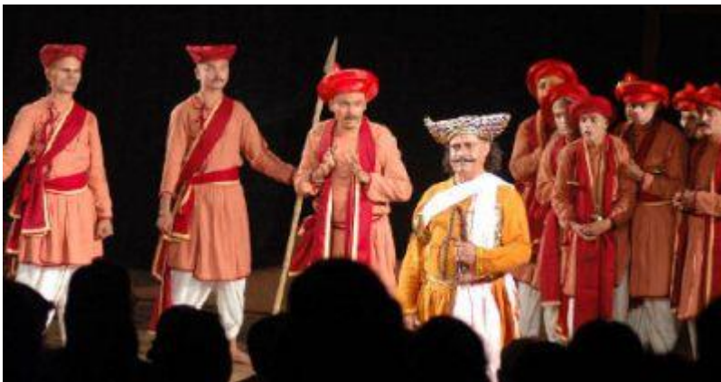
Figure 6: Tendulkar's popular play 'Ghashiram Kotwal', inspired by the rise of the Shiv Sena, was first directed by B.V. Karanth. Above, a scene from the play when it was staged at Bharat Bhawan in Bhopal on September 3, 2006, to mark the fourth death anniversary of Karanth.

Tanvir, however, exercises caution in the use of the 'folk' and says that in an urban milieu, his attempt cannot be to conserve or recover 'authentic folk forms' but to find an idiom that transcends the rural/urban divide. In his Naya Theatre, which consisted of actors from Chattisgarh, he would improvise plays with the help of his actors and make them relevant to their context.