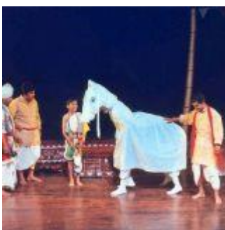
Figure 6: A scene from Girish Karnad's Hayavadana directed by B.V. Karanth

Vijay Tendulkar in Ghashiram Kotwal (1972), Girish Karnad in Yayati (1961), Tughlaq (1964), Nagamandala (1988), Badal Sircar in Ebong Indrajit (1962), Pagla Ghoda (1967) and Utpal Dutt in Angar (1959), Mahabidroh (1985) variously use folk forms, sometimes to universalize social and political oppressions and at other times to widen their repertoire and to carry political messages.