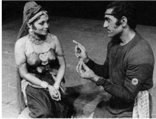
Figure 7: Amrish Puri in Girish Karnad's Yayati directed by Satyadev Dubey.