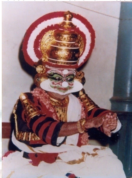
Figure 3: The 2,000 year old Sanskrit drama tradition Kutiyattam, performed in Kerala, southern India, strictly follows the Nāṭya Shāstra . Guru Nāṭyāchārya Māni Mādhava Chākyaṛ as Ravana in Bhasa's play Abhiṣeka Nataka