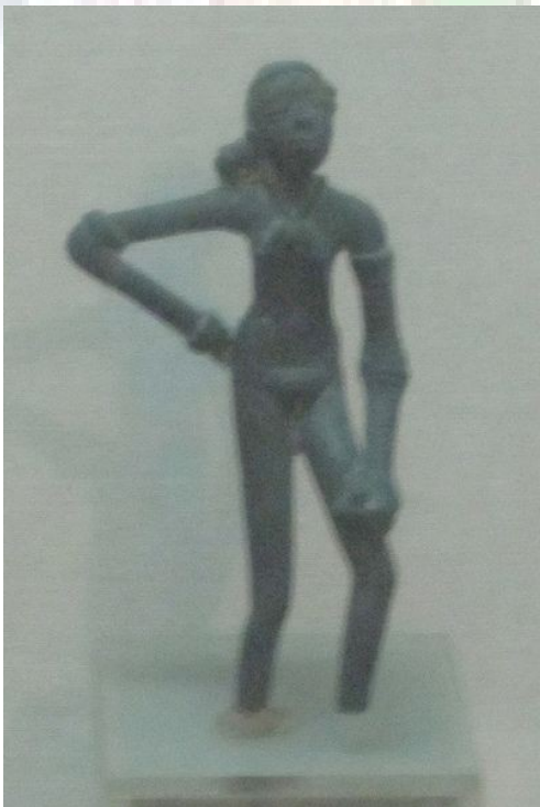
Figure 1: Figure of a dancing girl discovered in 1926 at Mohenjo-daro

As mentioned in the previous chapter, drama seems to have evolved from ritual impersonation , dance, community recreation and magic. Prehistoric picture galleries and cave paintings found in Bhimbetka are important evidences that trace the story of the evolution of theatre. Musical instruments, stone and bronze dancing figures, clay masks and assembly halls for performances discovered in the archaeological remains of the Indus Valley indicate the presence of rudimentary performative traditions.