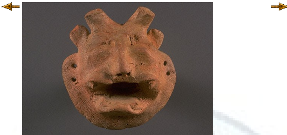
Figure 2: Mask/ amulet found at Harappa. Loosely included under the rubric of terracotta "figurines" are the terracotta masks found at some Harappan sites. One mask clearly has a feline face with an open mouth with exposed fangs, a beard, small round ears and upright bovine horns. It is small and has two holes on each side of the face that would have allowed it to be attached to a puppet or worn, possibly as an amulet or as a symbolic mask. The combination of different animal features creates the effect of a fierce composite animal. As an amulet or a symbolic mask, it may represent the practice of magic or ritual transformation in Indus society.