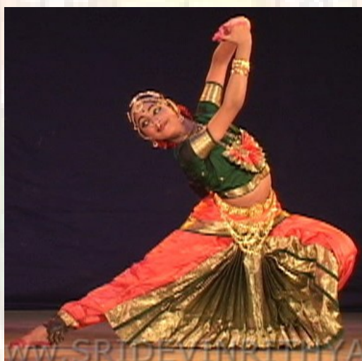
Figure 4 : Mudras in Bharatnatyam