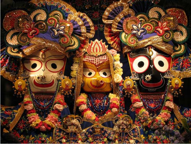
(Balabhadra, Subhadra and Jagannath, the triad associated with the Jagannath cult)